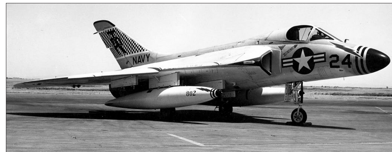
A close-up study of the markings on a FAGU Skyray at the Naval Air Weapons Meet on 14 April 1958.

The Fleet Air Gunnery Unit Pacific (FAGUPAC) was commissioned on 22 May 1952 at NAAS El Centro,