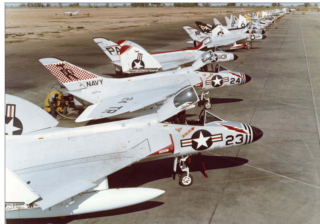
Two Fleet Air Gunnery Unit (FAGU) Skyrays in the foreground of the flight line at the Third Annual Naval Air Weapons Meet, 14 to 18 April 1958, at El Centro, California.