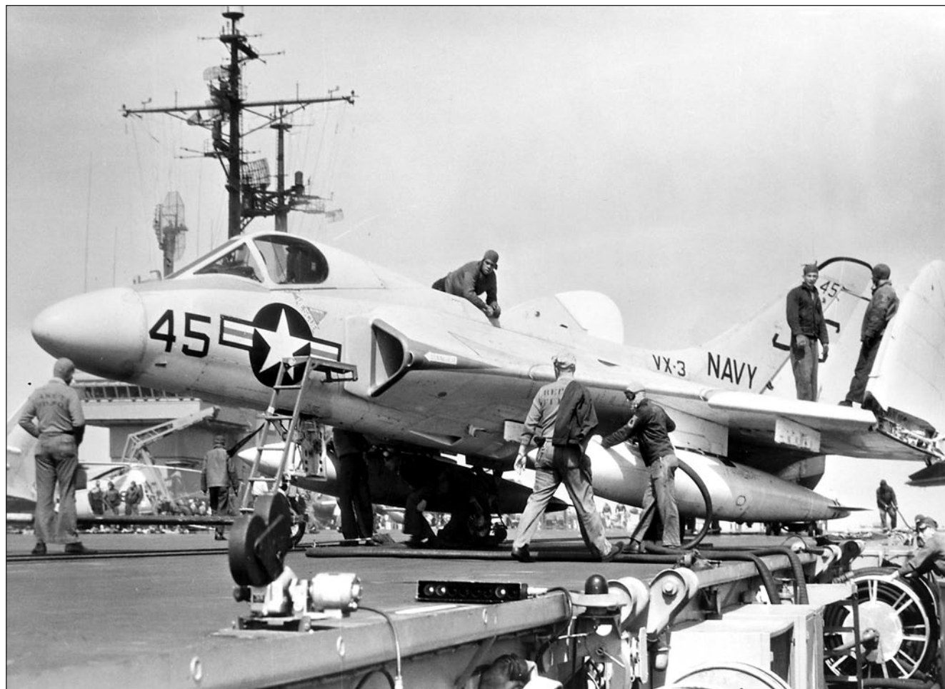
A VX-3 Skyray being prepared for launch from the USS Forrestal (CVA-59) in April 1958 during a TACAN evaluation project. The tail code of VX-3 had been changed to JC.

VX-3 Skyrays carried a tail code of XC, and VX-3 painted on the spine with a nose number located aft of the radome. The squadron was scheduled to relocate to NAS Roosevelt Roads, Puerto Rico, in February 1960 but it was decommissioned on 1 March 1960 and its Skyray inventory was transferred to other Fleet squadrons. 2